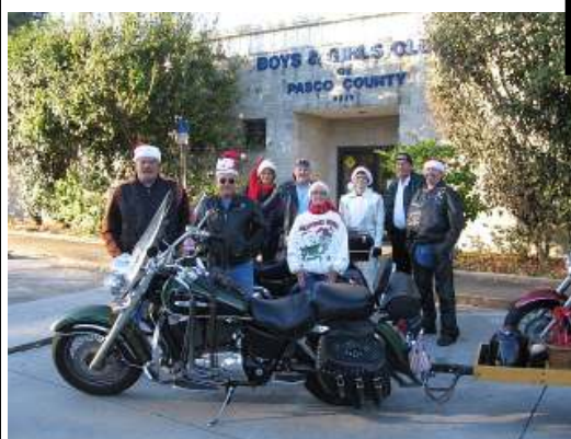
Check presentation Boys & Girls Club of Pasco County