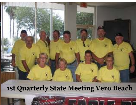
1st Quarterly State Meeting Vero Beach