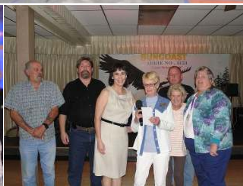
Check presentation to Gulfside Regional Hospice of Pasco County